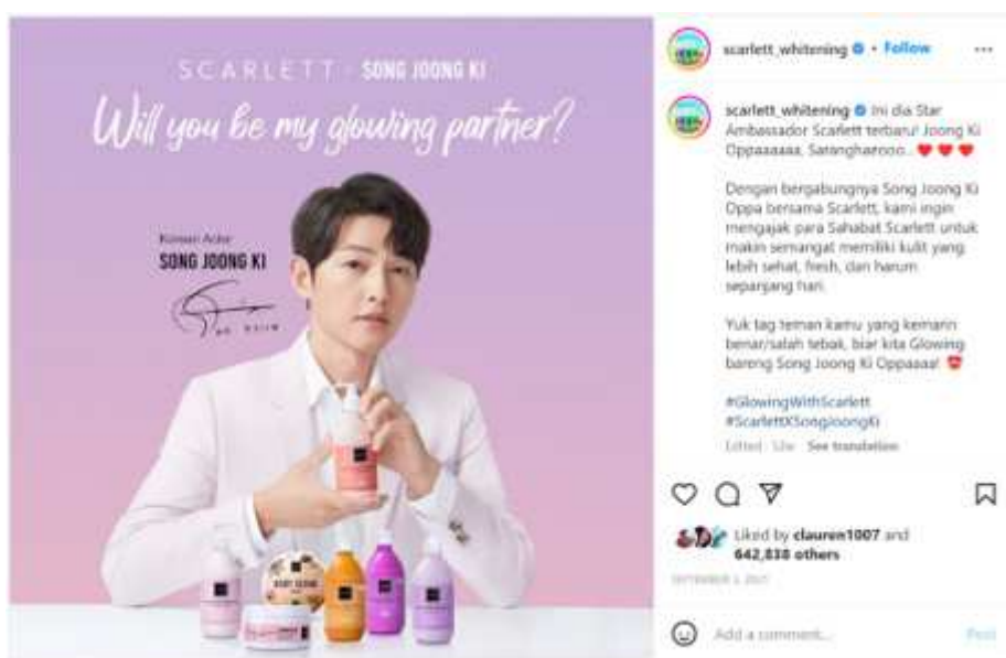
Figure 1 Scarlett Whitening's First Post Featuring Song Joong Ki

At this stage of the compositional metafunction, the researcher relates the relationship between the two previous metafunctions, namely representational and interpersonal, to find out the message the producer wants to convey. The placement of images in this advertisement has an important meaning because the producers are trying to attract readers' attention by placing an image of a human model who acts as the center of the advertisement by displaying the image that radiates from the object. This implies that the human image represented by Song Joong Ki is the center for conveying the message to the reader. The composition of the image elements on this Instagram page represents the purpose of the producer. At the representational metafunction stage, it is read that the image has a solid narrative to invite readers to buy and consume the product. The interpersonal metafunction