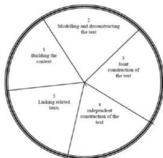
Figure 1. Phases of the teaching/study cycle

This sequence is a text-based conceptual process that guides the student from the dependent to the independent development of understanding (Burns, 2010; Callaghan & Rothery, 1988). Feez (1998) established that GBA phases span five stages: building context/building knowledge in the field (BKOF), modeling and deconstructing text (MOT), joint construction of the text (JCT), independent construction of the text (ICT), and linking relevant texts (LRT). The five phases are shown in Figure 1.