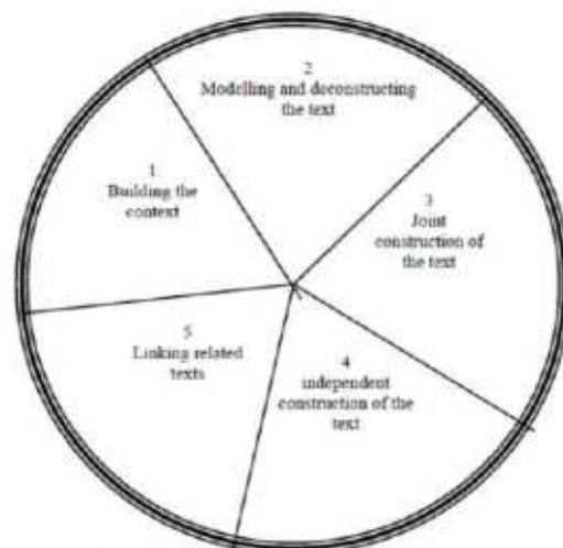
Figure 1. Phases of the teaching/study cycle.

This sequence is a text-based conceptual process that guides the student from the dependent to the independent development of understanding (Burns, 2012; Callaghan & Rothery, 1988). Feez (1998) established that GBA phases span five stages: building context/building knowledge in the field (BKOF), modeling and deconstructing text (MOT), joint construction of the text (JCT), independent construction of the text (ICT), and linking relevant texts (LRT). The five phases are shown in Figure 1.